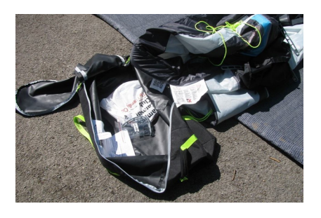
3. Begin to roll the awning as tightly as possible.

1. Fold the awning lengthways to make a long, thin sausage shape.