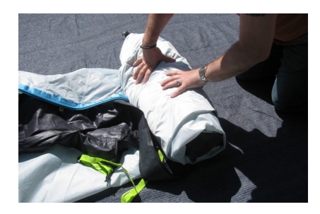
4. Place the rolled awning onto the bag and pull the sides up around it. Finally, zip-up the bag.

1. Fold the awning lengthways to make a long, thin sausage shape.