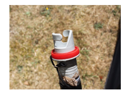
5. Replace the cap on the 'Dynamic Speed Valve' and cover the valves with the flap to prevent water getting inside.

3. Locate the 'Dynamic Speed Valve' and ensure the valve is closed , before attaching the pump (the valve is closed when the button is pressed out).